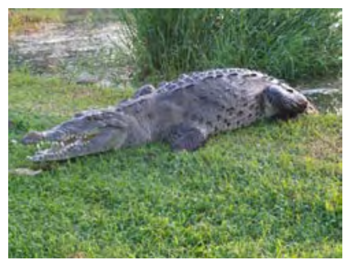
Figure 1. American crocodile coming out a lake at Palma Real Golf Course.

We made diurnal and nocturnal visits to each site, and recorded 117 crocodile sightings, of which 64 (55%) crocodiles were longer than 2.5 m total length (Fig. 1). Some individuals were estimated to be 4.5 m long. The majority of sightings (N= 92; 79%) were at 4 sites (Playa Linda estuary, Pacífica, Palma Real Golf Course and Playa de la Ropa estuary) - these appear to the sites with the greatest movement of crocodiles to the sea (Playa Linda) and back. The total survey distance was 5-6 km. Sites varied in length, but were all less than 1 km long.