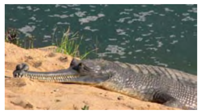
Figure 1. Gharial ( Gavialis gangeticus ).

'Gharial' is a Hindi word meaning "one with a ghara" (the 'ghara' is the growth on the nose tip of an adult male gharial). Gavialis gangeticus is the only species that fits that description (Fig. 1). Although a recent molecular study has shown that T. schlegelii is closely related to G. gangeticus and there is a suggestion to place it in the same family Gavialidae, (Willis et al. 2007) that is still no grounds to call it a gharial.