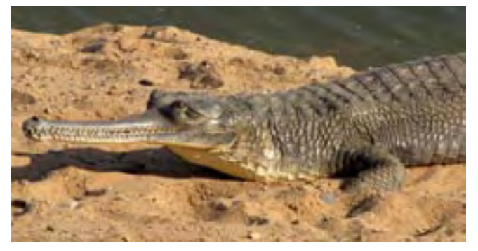
Figure 1. Female Gavialis gngeticus.

I am keen to obtain any information on this population, as I will be returning there in May. Any suggestions on other sites to visit, or specific aspects to looked into, would be greatly appreciated.