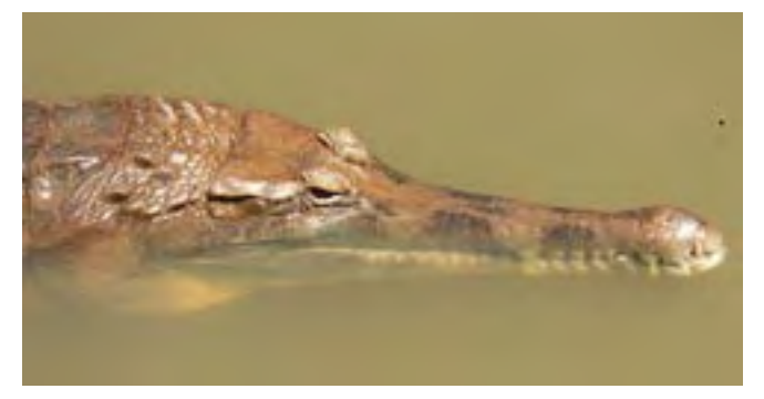
Figure 2. Tomistoma ( Tomistoma schlegelii ).

The CSG's Tomistoma Task Force (TTF) suggests that henceforth the use of the common names "false gharial" and "Malayan gharial" are no longer appropriate and that the species should be commonly referred to as Tomistoma (Latin for "sharp mouth") (Fig. 2), a name which has been in use in published literature for many decades (Neill 1971). Since there is no other contender for the name, the TTF suggest that the "Indian" gharial be called Gharial with no geographic prefix. It is hoped this name change will help T. schlegelii