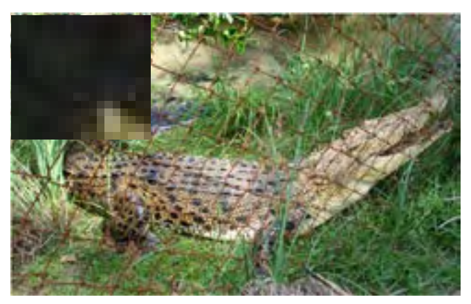
Figure 1. Gori, the pale coloured Saltwater crocodile used as mascot (inset) for the 15th National Youth Festival.

Bhubaneswar, the capital of Orissa State from 8- 12 January 2010. This exemplifies our Government's commitment to crocodile conservation in India.