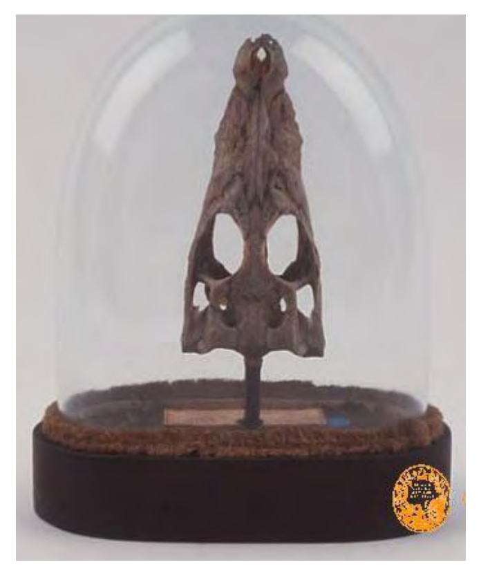
Figure 1. The Thebes mummified skull of Crocodilus suchus Geoffroy in the MNHN-Paris.

There is a Senegal C. niloticus in the MNHN (Paris) that claims to be the type (sic) of C. suchus Geoffroy, but the real meaning of the specimen's identity label is that it is the one that Duméril and Duméril (1851) used to exemplify Geoffroy's range extension of C. suchus to Senegal. It is an important animal (essentially a paratype of Geoffroy's suchus ), but the Senegal (Niger) animal from Adanson is not the true holotype specimen for the name C. suchus Geoffroy-Saint-Hilaire, 1807. The real suchus skull, the sacred crocodile of Egypt ("Croc. sacré" of Duméril and Duméril 1851) that was collected at the Thebes catacombs, is probably in the MNHN-Paris. I have seen photographs that confirm the general accuracy of the 1807 illustrations. The little skull, without mandibles, has a glass dome covering it, and is on a rod elevating it above its circular plinth (Fig. 1).